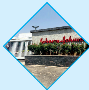
Johnson & Johnson